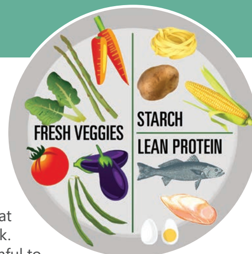
Diabetes Plate Method

Try to eat foods that are steamed, broiled or baked. Fried foods have a lot of fat and can be bad for your heart. Limit how many sweets you eat and sodas you drink. Sweets can be harmful to